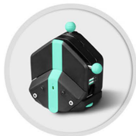
EasyPump Series (Pressure Adjustable)