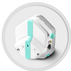
EasyPump Series (Fixed Pressure)