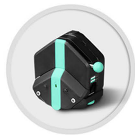
EasyPump Series (Fixed Pressure)