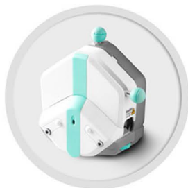
EasyPump Series (Pressure Adjustable)